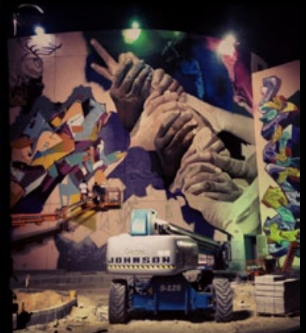
Free commission work for - The O1NE" - project in Abu Dhabi.