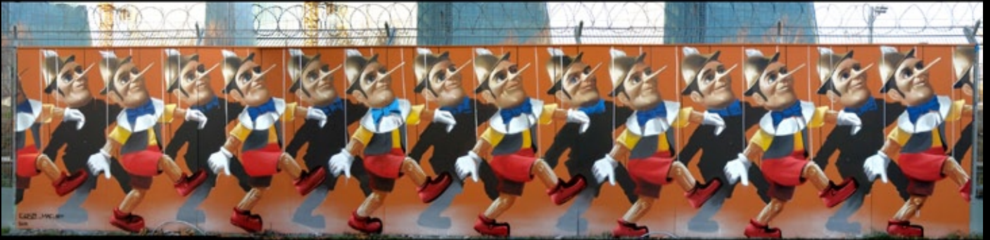
New ECB building |