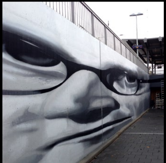
Portrait of Konrad Zuse, in his native town Huenfeld. The commission for Deutsche Bahn is placed at the main station of Huenfeld. It's a distorted picture to open the floor to both sides and to create a feeling to walk into the picture. Each side of the portrait is over 80ft long.