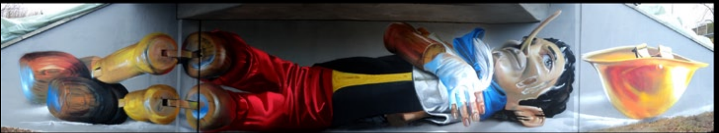
Part two in Schwanheim , suburb of Frankfurt