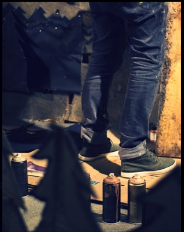
Pretty nice little performance in Innsbruck for Rhythm Livin, a Clothing Label from Australia.