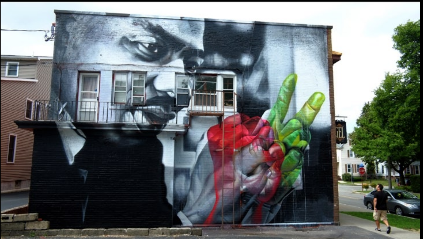
For the Wall Therapy Festival in Rochester on the occasion of the 50th anniversary of the famous "I Have A Dream" speech of von Martin Luther King.